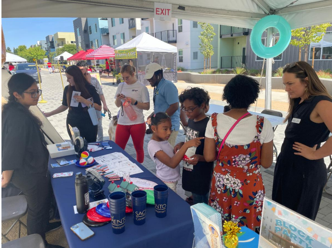
Neighbors and friends attended the Friends of the River District Block Party and Pop-Up Market at the Hayley Apartments at Township 9 on June 26, 2025.