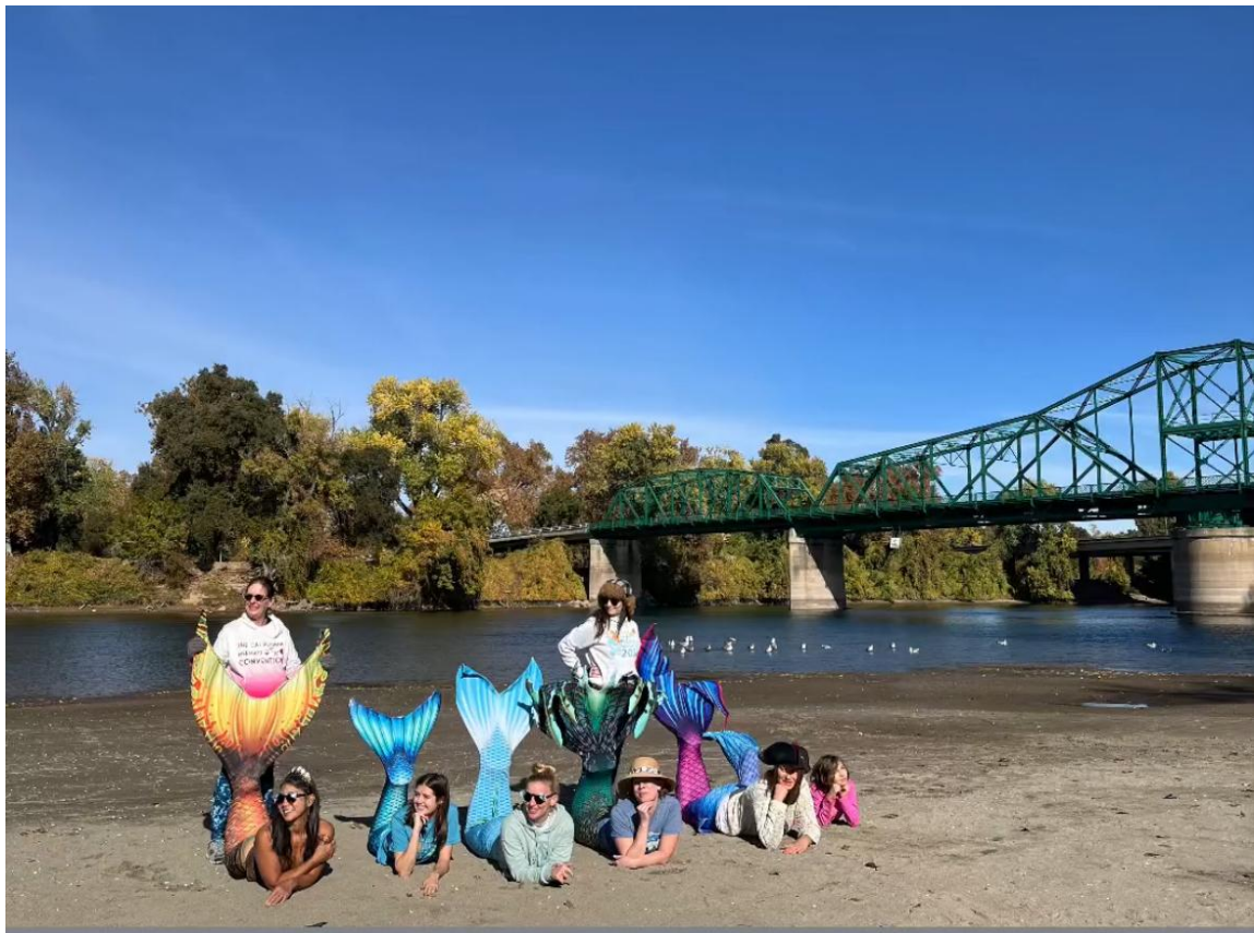
On November 16, 2024, attendees of the California Mermaid Convention made a splash in the Sacramento River District, trading fins for gloves to participate in a community cleanup at Tiscornia Park. Fifty-nine volunteers joined forces to remove over 350 pounds of waste,