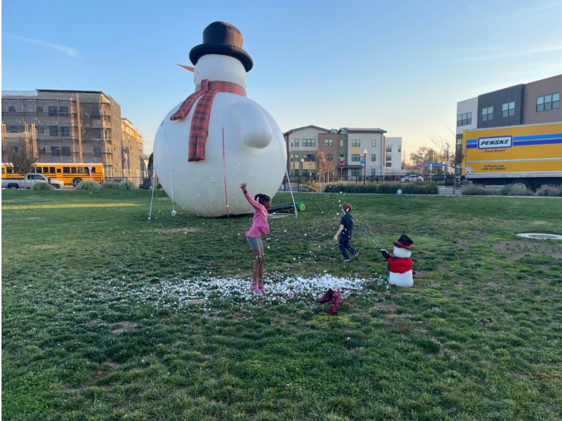
Attendees of the River District Community Extravaganza enjoyed the thirty-foot tall inflatable snowman, and its smaller friend, the snow-blowing snow man!