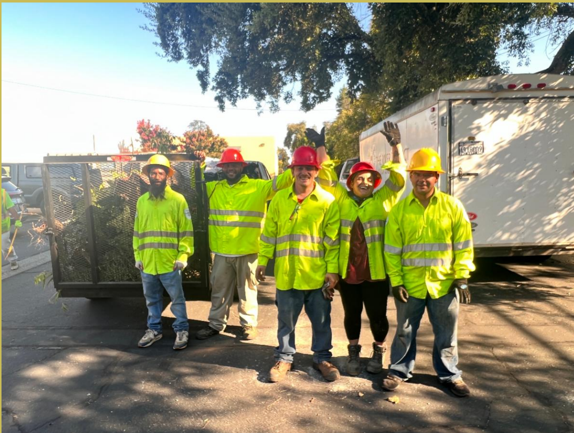
The River District Public Spaces Team has received an award of excellence from the International Downtown Association (IDA) for its innovative approach to district maintenance.