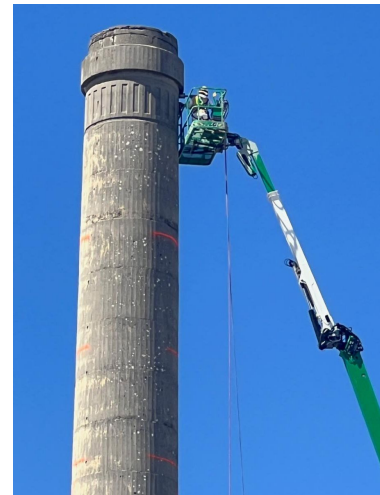
Crews began demolition of the historic city incinerator in late May after the city's housing and dangerous buildings division classified the structure as "immediately dangerous" due to asbestos and paint containing lead, and leaded bricks within the smoke stack.

The good news is that several components of the original structure have been preserved and saved by the River District for inclusion in a future redevelopment project at the site, working with the current tenant of the property. The River District will be advocating for additional considerations, including recreation of the structure's unique facade, when new development occurs on the site.