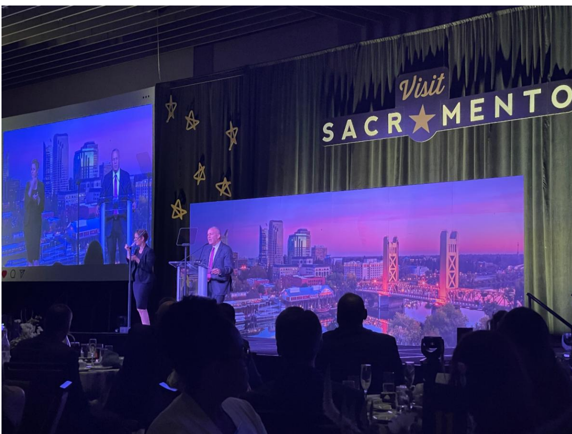
Sacramento Mayor Darrell Steinberg was awarded the inaugural Tourism Champion Award at Visit Sacramento's State of the Hospitality Industry address on June 12, 2024.

At its annual State of the Hospitality Industry event on Wednesday, June 12, Visit