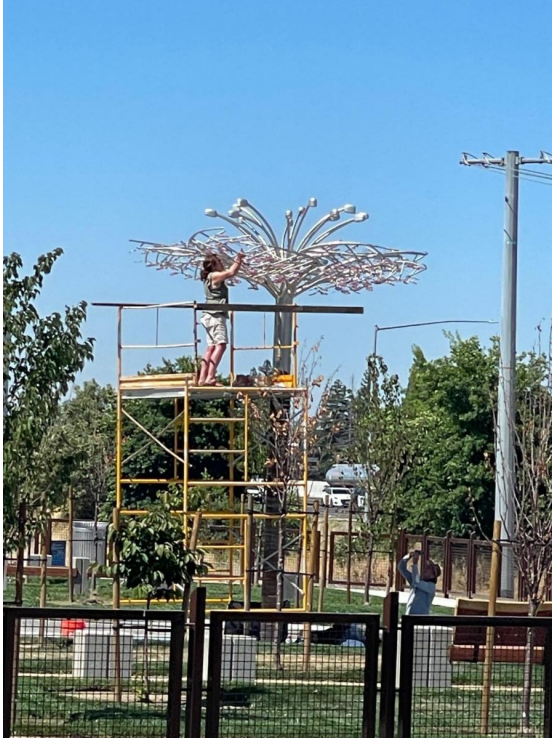
The one-of-a-kind kinetic art sculpture at the end of the Matsuyama Dori, or walkway, being installed on Friday, June 14, at the Hanami Line at Matsui Park. The sculpture was created by Reed Madden Designs of Richmond. The sculpture's "blossom" will turn gently in the wind and will have colorful LED lights and colored glass that will provide pools of light and color regardless of the time of day.

"Hanami" means "flower viewing" and is a very popular activity during the spring when the trees blossom. The park will be a place for people to picnic, play and relax. Year-round activations will include art, food and music events as well as healthy activities like yoga in the park.