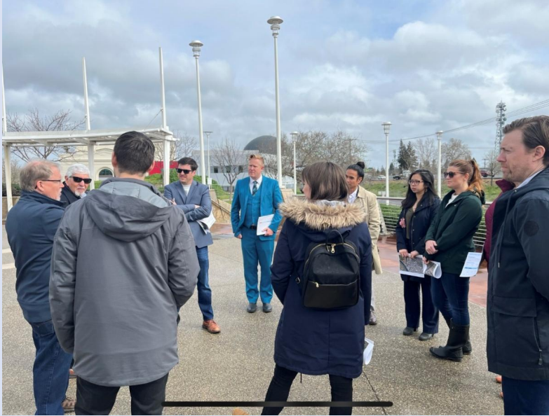
River District board members and stakeholders met with staff from the City of Sacramento as well as consultants from Atlas Lab and Cooper Robertson for a site visit on March 22, 2023.